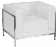
SORRENTO CHAIR WHITE