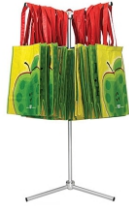
Tote Bag Holder

Looking for an item you do not see? Please call our office for availability and pricing.