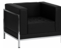
SORRENTO CHAIR BLACK