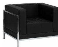
SORRENTO CHAIR BLACK