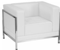
SORRENTO CHAIR WHITE