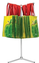
Tote Bag Holder

Looking for an item you do not see? Please call our office for availability and pricing.